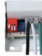
Tool-free Wattage Selectable Switch (red switch)