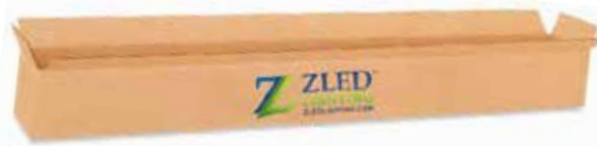
Job Pack Box