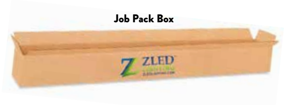
Job Pack Box

MRK2440-40K-PLUS MRK2440-40K-HO-PLUS-MS MRK2440-40K-AO-PLUS